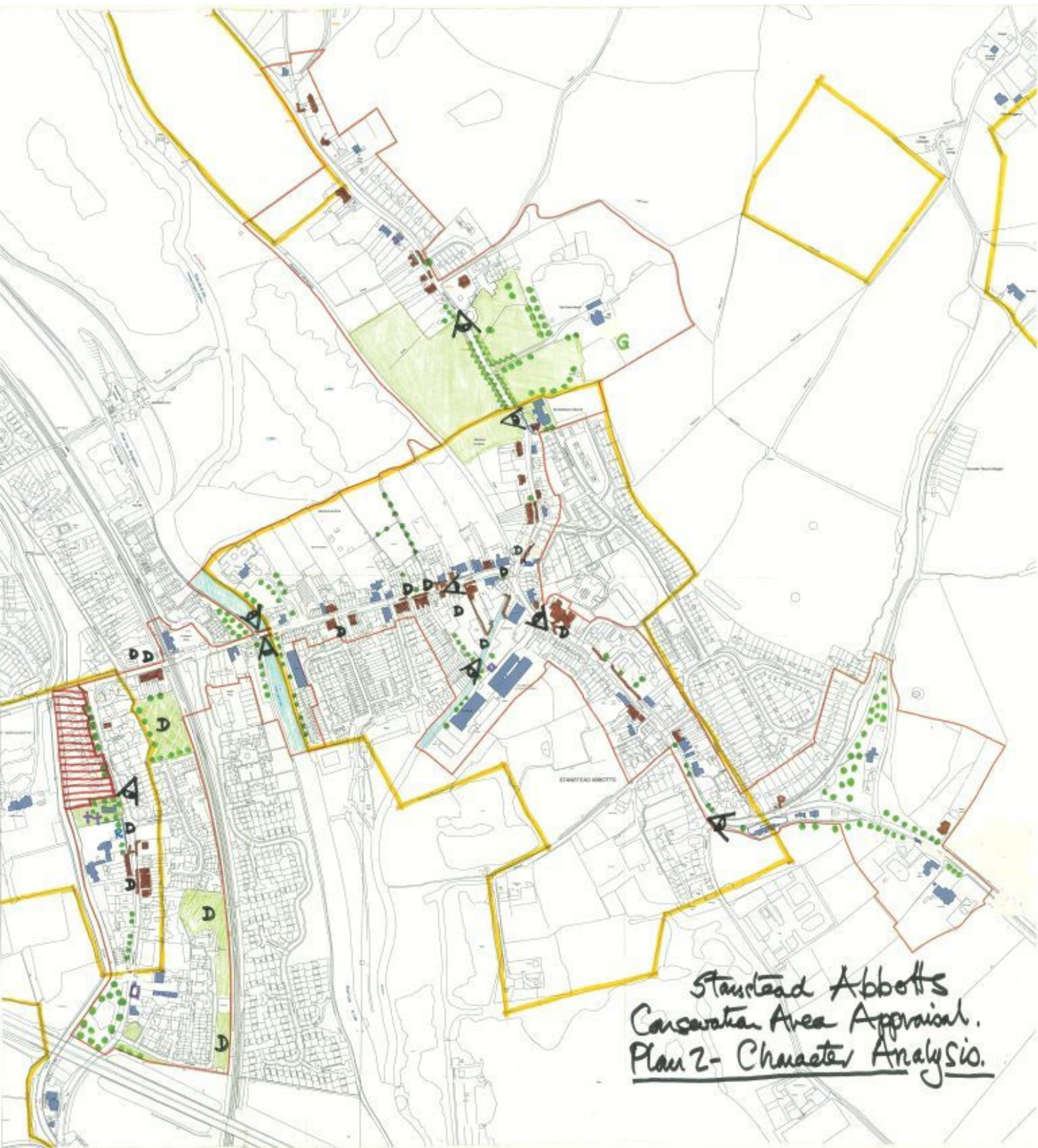
Sturtead Abbotts Conservation Area Appraisal. Plan 2 - Character Analysis.